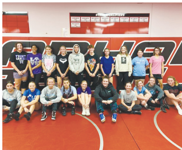
West Fork Girls Wrestling Squad

For the first time ever a local co-op squad of girls' wrestlers competed in a sanctioned girls' wrestling meet in Decorah Saturday, Nov. 19. In a historic change for women's wrestling in Iowa, the Iowa High School Girls High School Athletic Union (IGHSAU) voted at its January 2022 board meeting to sanction girls' wrestling as a sport, meaning high school girls will now wrestle other girls instead of boys.