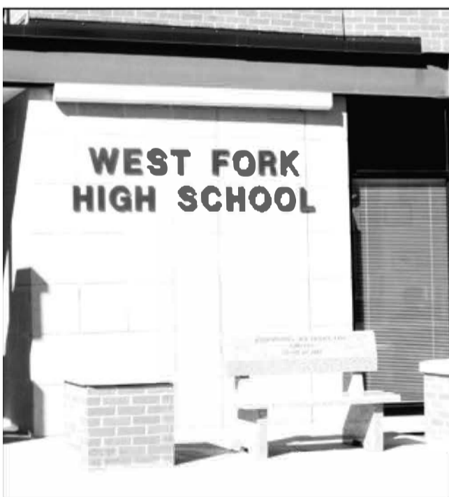
West Fork High School