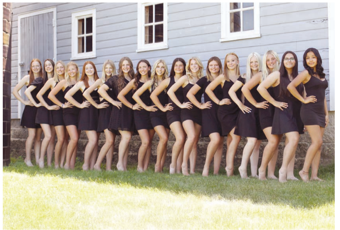
West Fork Dance Team

West Fork will perform Hip Hop at 2:15; Pom at 3:22; and Jazz at 4:33 pm