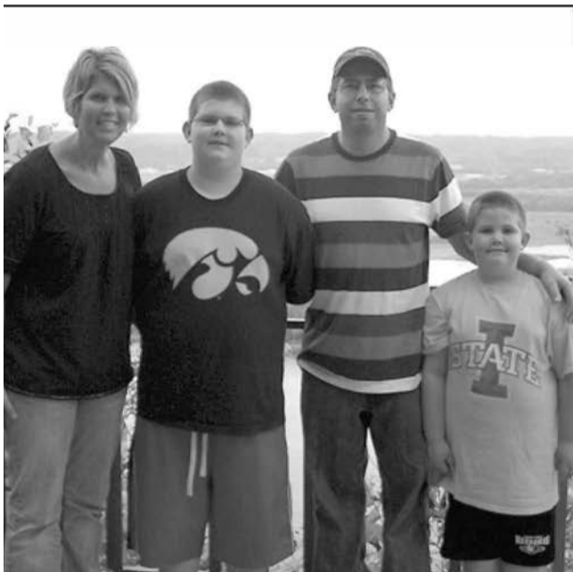
Sheffield Suds & Storage