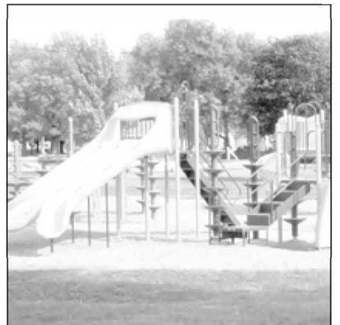
Marie Ayres Park