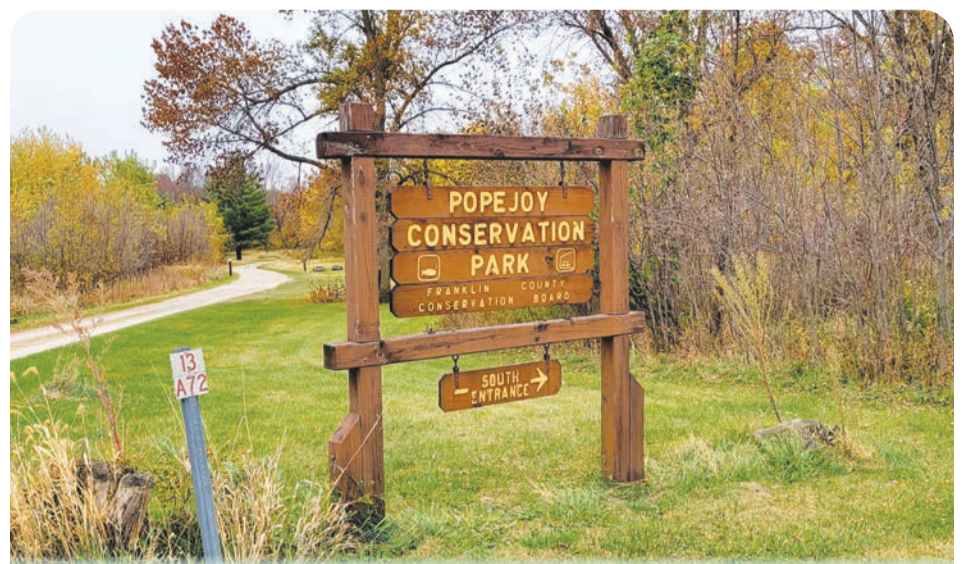
Popejoy Park sign at the north entrance of Popejoy Park