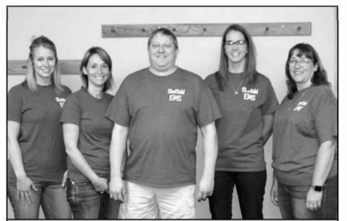
Sheffield Medical Emergency Squad