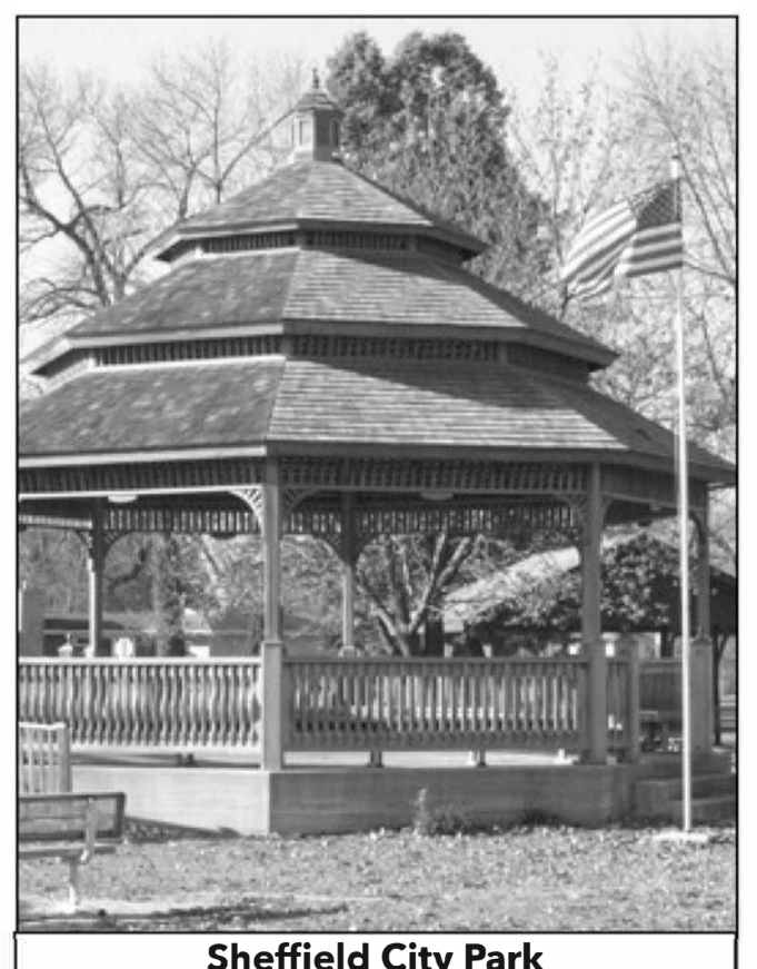
Sheffield City Park