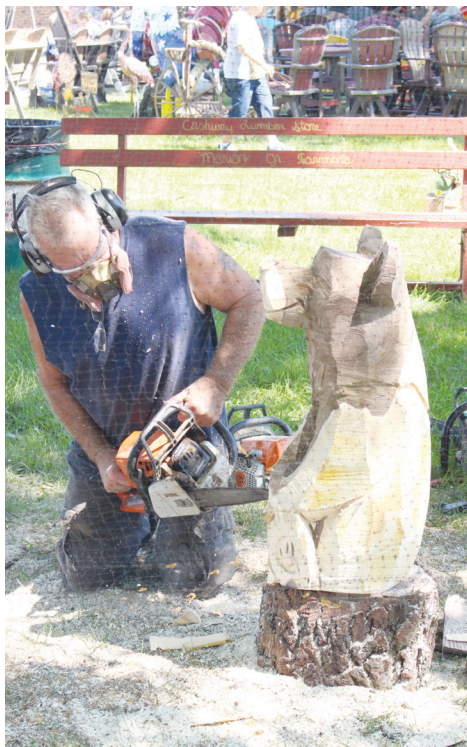
Come check out the auction for wood sculptures!