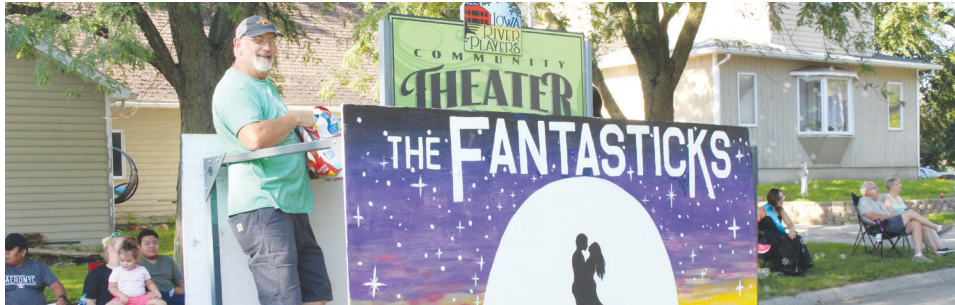
The Franklin County Players will put on their next community play in August.