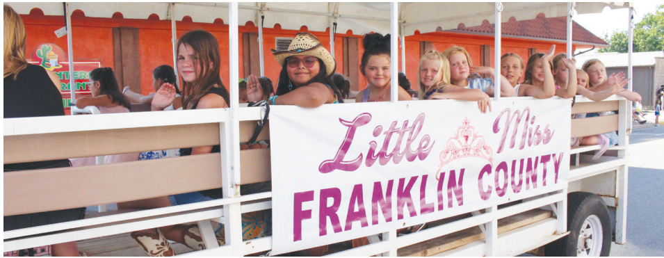
Little Miss Franklin County contestants parade through town before their contest on Thursday.