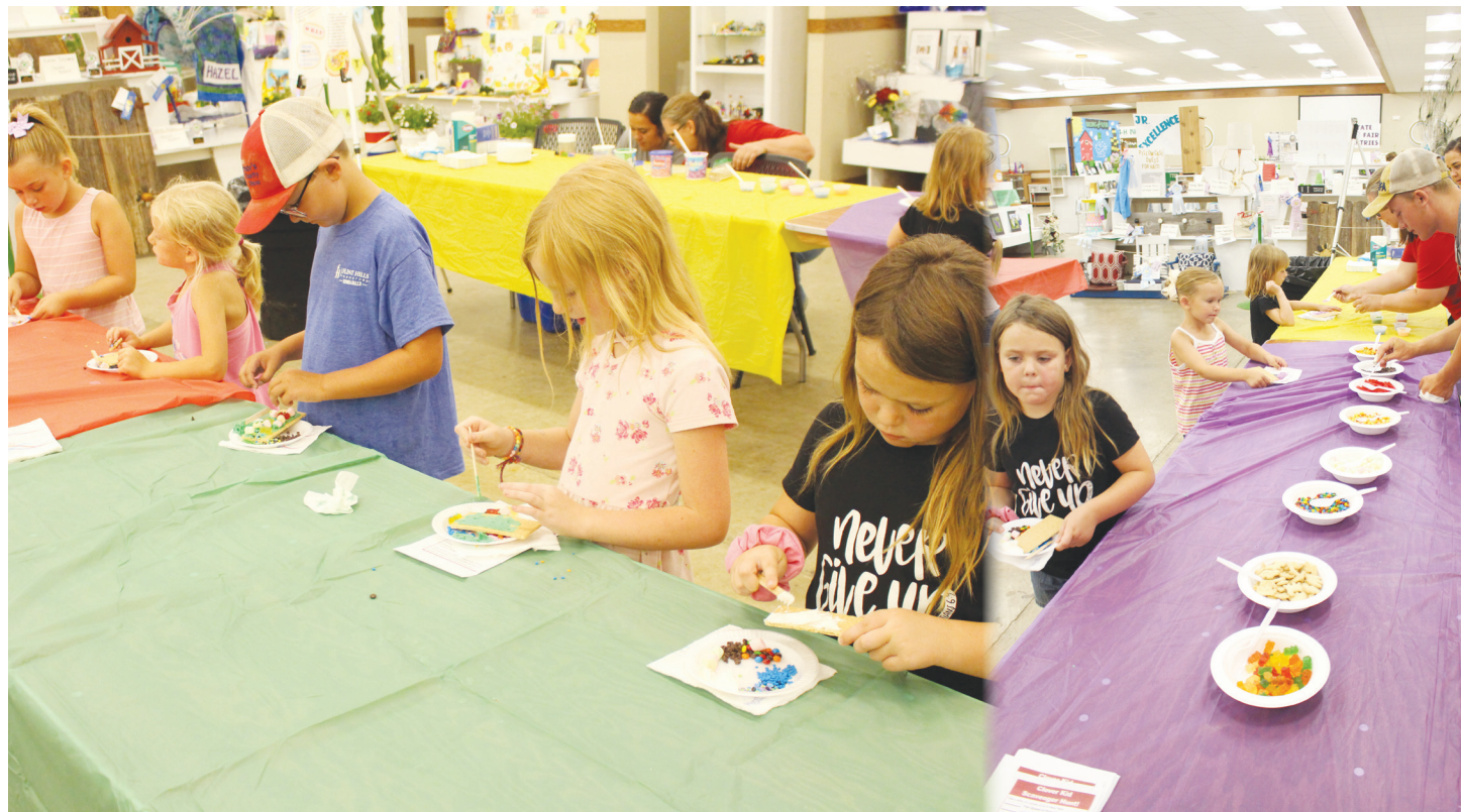
Kids at the fair enjoyed a cookie decorating contest.