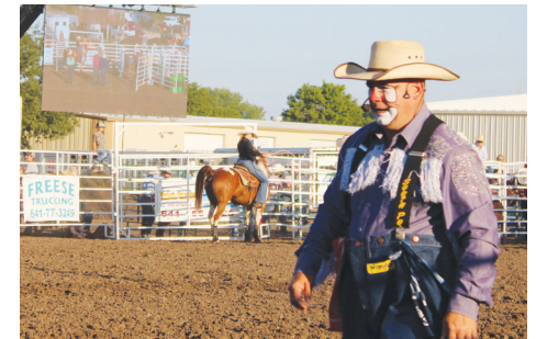
A rodeo clown provides some entertainment between the sets.