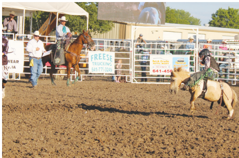
The rider begins to slide off the pony after it bolts around the ring.