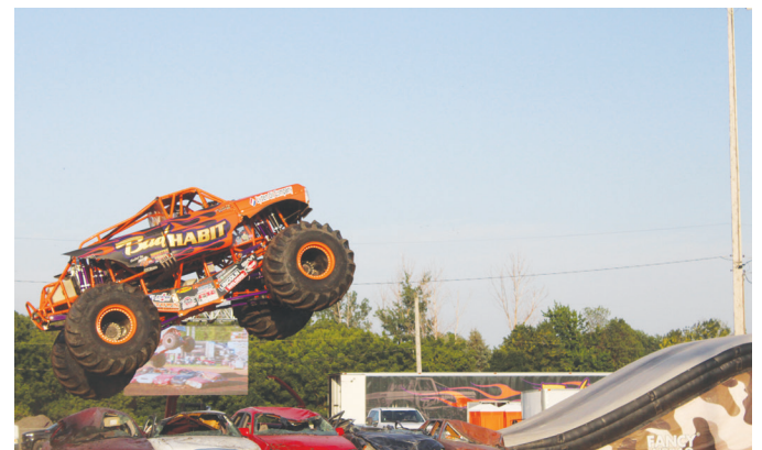
The truck "Bad Habit" launches over four old cars.