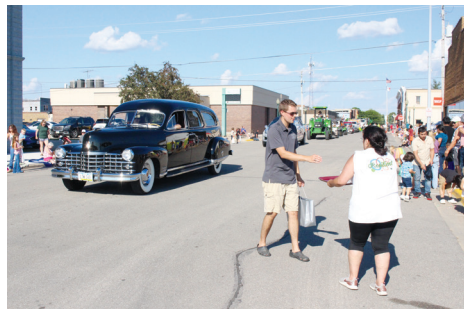
Counsell Woodley associates handing out candy!