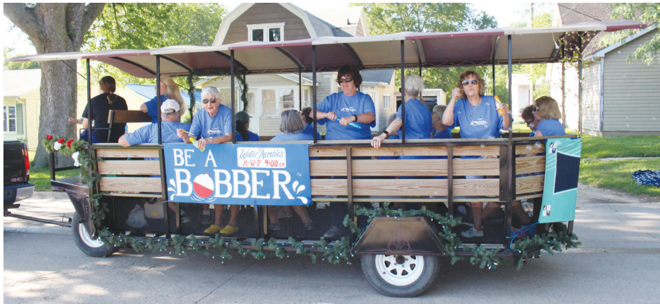
These young ladies invite you to join water aerobics at the Franklin County Wellness Center