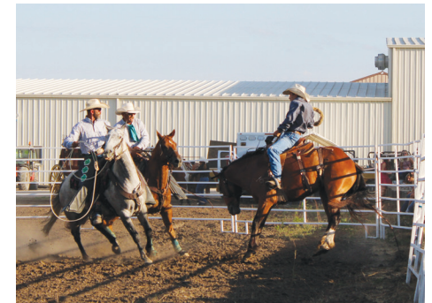
The rider clings on, hoping to win the competition.