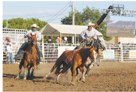
After the rider is knocked off the horse is herded out of the arena by awaiting cowboys