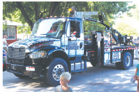
Hanson & Sons always ready to lend a hand!