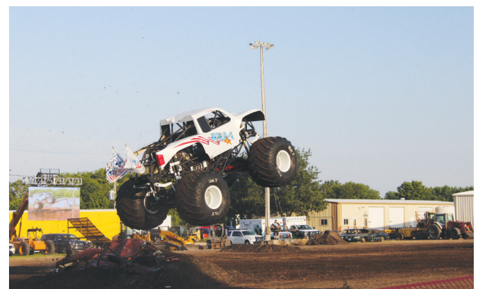
The truck "USA-1" catches some air in the Two Wheel Contest.