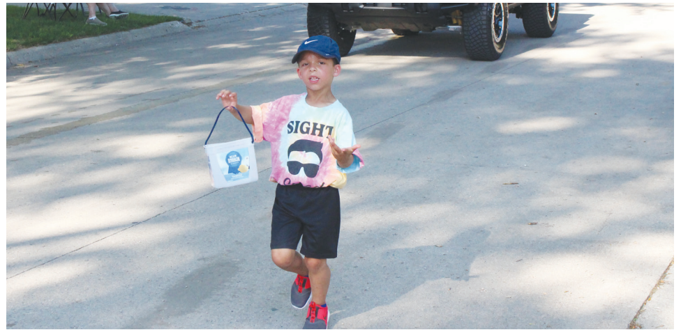
This Little guy helps to throw out candy!