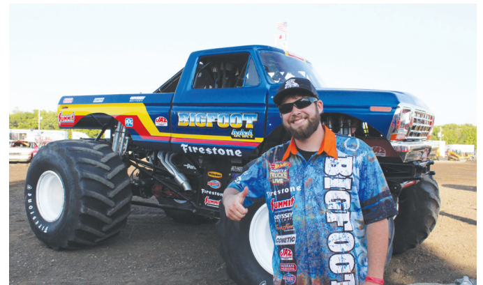
Monster truck drivers from across the Midwest come to show their skill at the Franklin County Fair. Auto-graphs were signed in front of the trucks before the show.