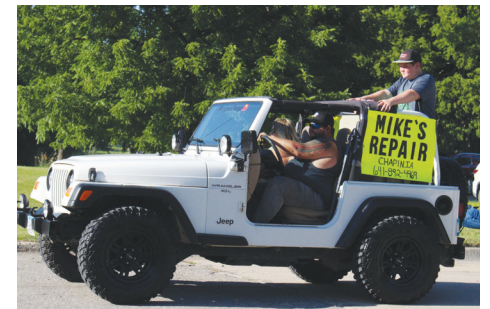
Need a repair, Call Mike's Repair!

Cultivate the land, produce livestock, and grow your leadership and environmental skills.