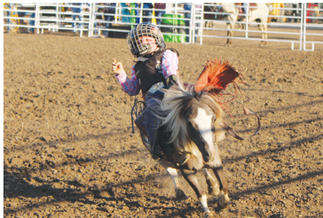
The 2022 Franklin County Fair featured Mini-Riders in the Rodeo.