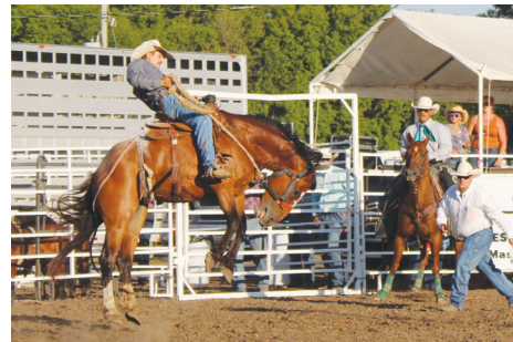
Cowboys stand ready to ensure the rider's safety when the horse throws him off