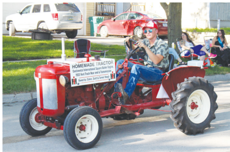
Homemade tractor!