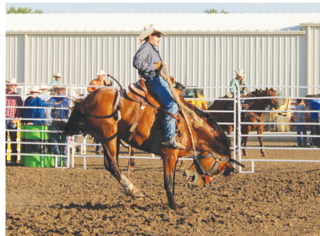
The horse works hard to buck off its rider.