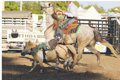
The ponies get herded back to the pen just like full-size horses